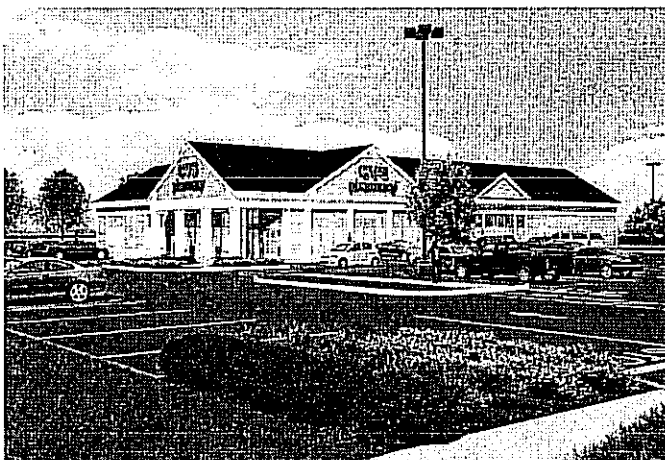
PROPOSED RENDERING FROM MAIN STREET LOOKING SOUTH EAST

Geeta Schrayter, Reporter - Rivereast News Bulletin